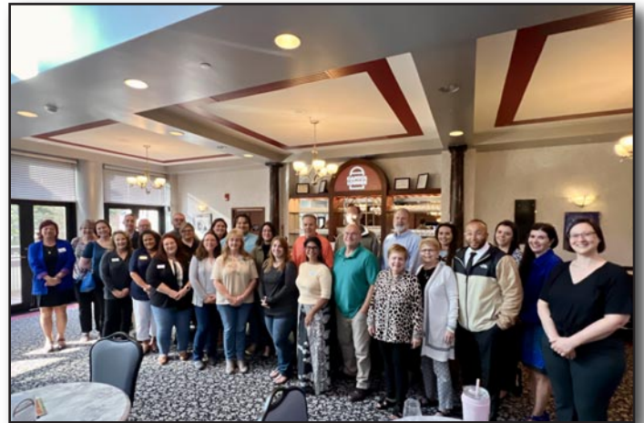
Community Arts Center hosts Off-Site Breakfast Briefing in 2024.

Approx. 225 people attend the Annual Meeting & Awards Ceremony in 2024. Each year, the Chamber staff surprises guests with a different theme.