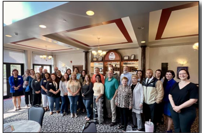
Community Arts Center hosts Off-Site Breakfast Briefing in 2024.

WellSpan - Evangelical Riverfront Financial Services