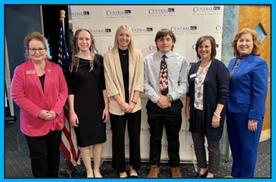
Legislative Events are held throughout the year and are a great way to reach a larger audience.