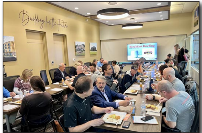
T-Ross Brothers Construction hosts Off-Site Breakfast Briefing in 2023.