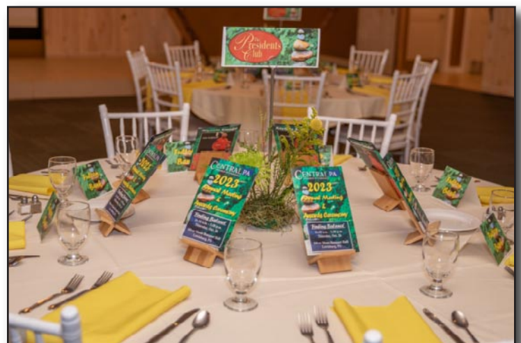
More than 200 people attend the Annual Meeting & Awards Ceremony. Each year, the Chamber staff surprises guests with a different theme.