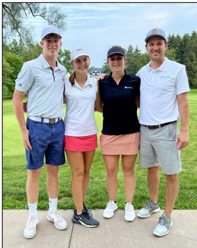
Members of the 2023 B&E Golf Tournament winning team.