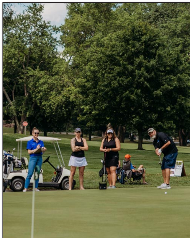
Members of Master Sponsor ClearView Asset Protection, participating in the Putting Contest, sponsored by Providence Engineering Corp., in 2022.