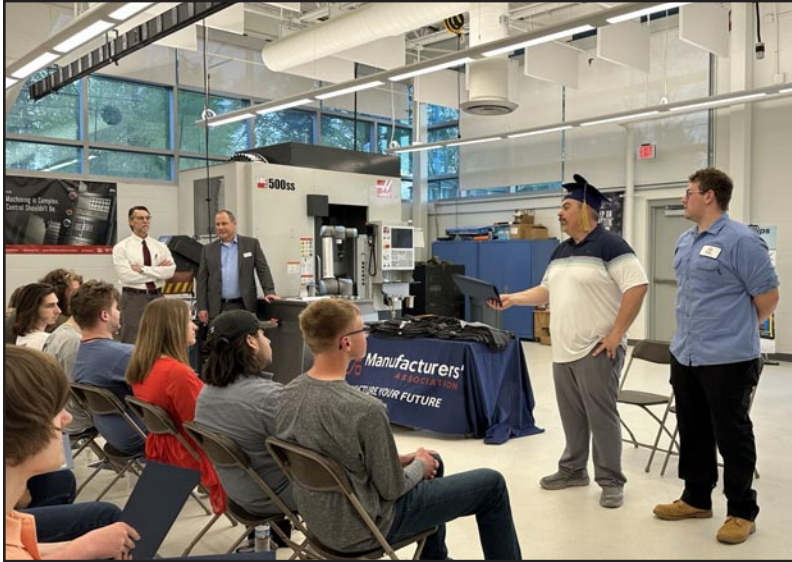
This year, Manufacturers' Association's Pre-Apprenticeship program graduated 70 students in total from across southcentral Pennsylvania.