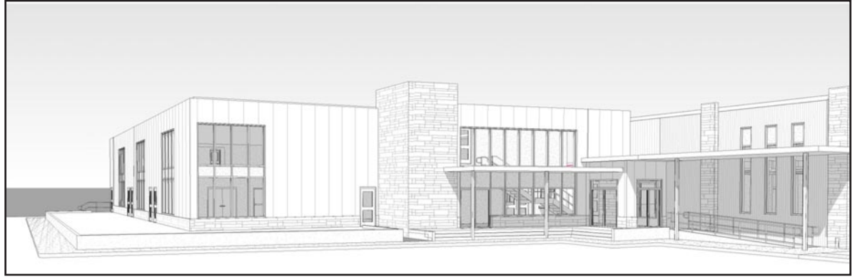
A rendering of The Miller Center's childcare center expansion.