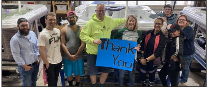
Strong Spas, Northumberland, was visited in May as a thank you for their participation in the Susquehanna River Cleanup Project on April 23. The company says their proud to help in the community and support the environment. Learn more at: sunburyrevitalization.org/events-programs/rivercleanup .