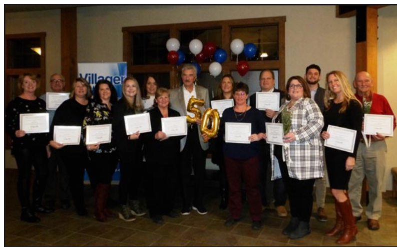
A group photo of the Silver Diamond Club, made up of members who had $3 Million or more in sales in the last year.

"Our exceptional Villager agents skillfully met the challenges of the market and the needs of their clients, with nearly $138,000,000 in real estate sales. We are very proud to share the list of recipients who earned company awards in 2022."