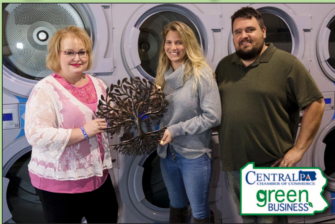
The Laundry Room of Lewisburg was the 2022 recipient of the Green Business of the year Award on Earth Day. Could your business be the winner this year?

To be considered for recognition, you must be: a member of the Central PA Chamber; Doing business in the region; and Demon-