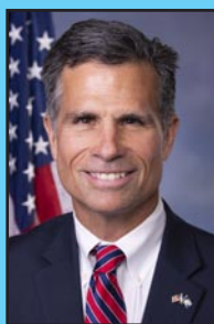
U.S. Rep. Dan Meuser (PA-9)

Congressman Meuser serves on the House Small Business and House Financial Services committees and is also a member of the Problem Solvers Caucus, the Republican Study Committee, Republican Main Street Caucus, and the Border Security Caucus.