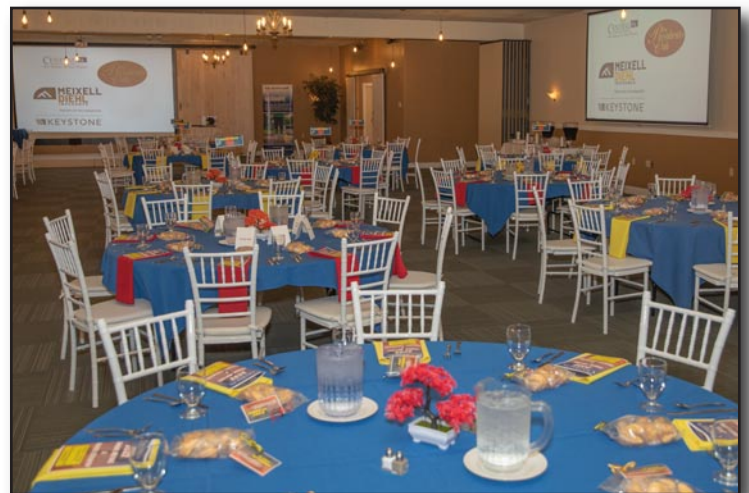
More than 200 people attend the Annual Meeting & Awards Ceremony. Each year, the Chamber staff surprises guests with a different theme.