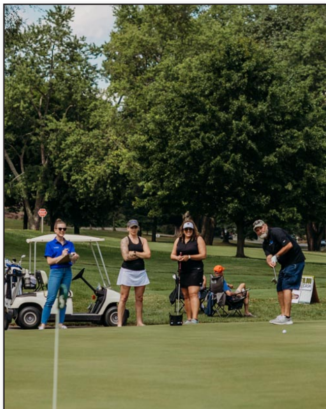
Members of Master Sponsor ClearView Asset Protection, participating in the Putting Contest, sponsored by Providence Engineering Corp., in 2022.