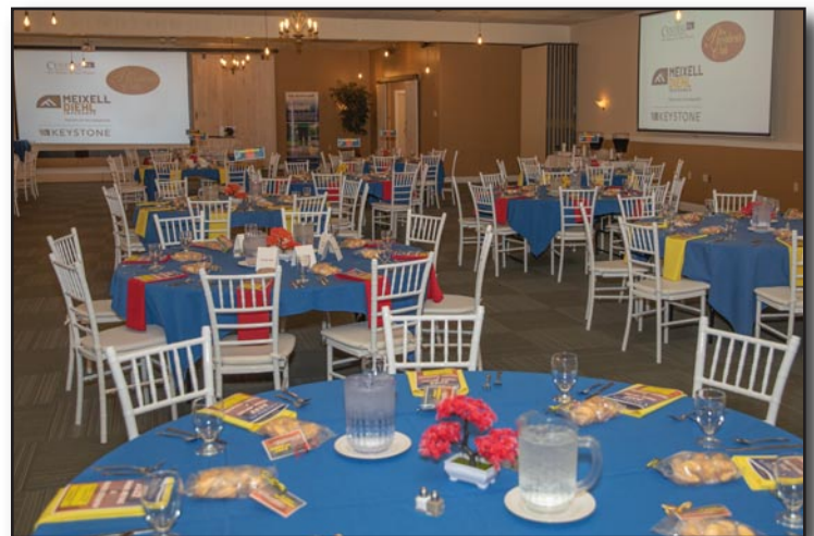
More than 200 people attend the Annual Meeting & Awards Ceremony. Each year, the Chamber staff surprises guests with a different theme.