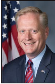
U.S. Rep. Fred Keller

The cost to attend the event in the Watson Inn’s Moon Room is $17 and includes a breakfast buffet. Register by Oct. 28 at www.centralpachamber.com/events . This Legislative Event is sponsored by PPL Electric Utilities.