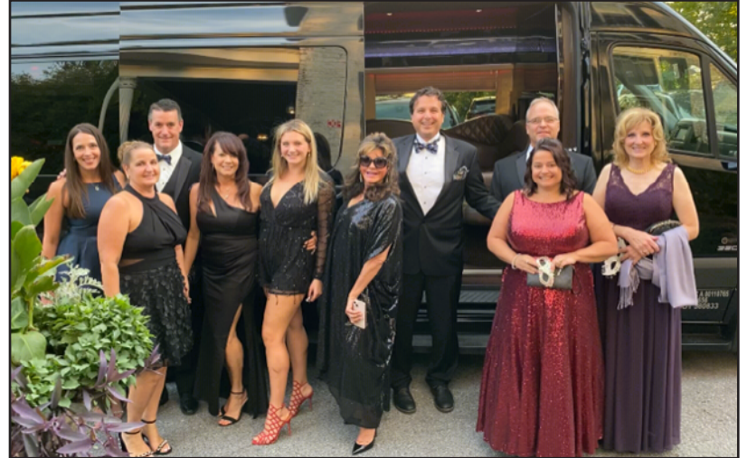
Several Central PA Chamber members recently took part in events that have directly benefited children and pets in our area communities. Above, at left, Lifting Little Lives made a $3,000 donation at its Annual Winefest By The River to The Magic Makers for its annual special needs prom in Lewisburg. LLL also donated a handicap tricycle for a boy from Northumberland County. Above, at right, T-Ross Brothers Construction was among the participants of the Ronald McDonald House of Danville's recent 4th Annual Masquerade Ball. It raised more than $50,000. Below, at right, Haven to Home Canine Rescue held a successful dueling pianos fundraising event in August at Whispering Oaks Vineyard. It's star for the day was the collie 'Otis', pictured here with his foster parents and new adoptive family. And, at bottom left, Arthur's Pet Pantry had a number of people turn out for its bingo fundraiser in Freeburg, also in August. Learn more about these organizations at www.centralpachamber.com/membership-directory .