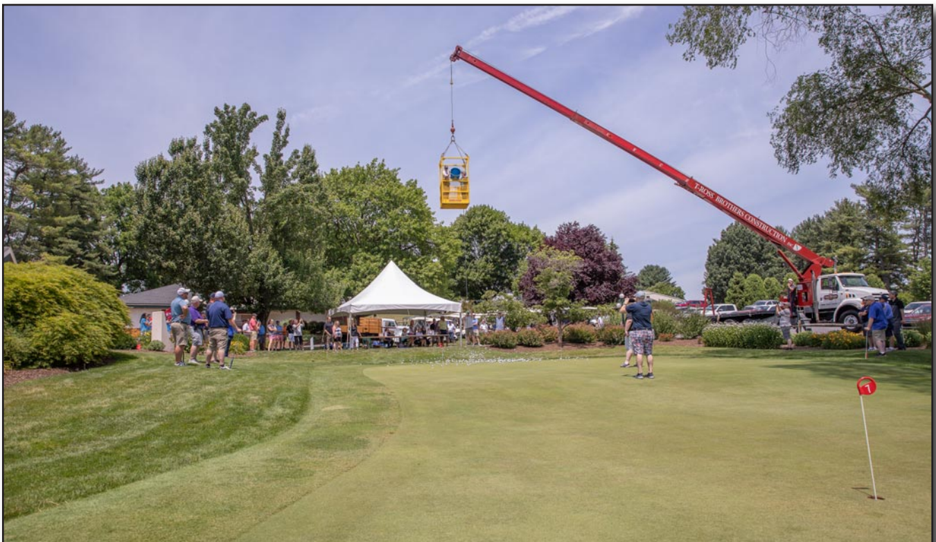
Hundreds of golf balls are dumped onto the practice green at Bucknell Golf Club for the annual Golf Ball Drop!, held prior to the B&E Golf Tournament.

For more information on benefits or sponsorships, call us @ 570-742-7341.