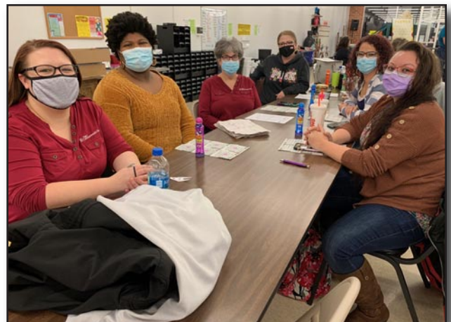
A team from First Commonwealth Bank enjoys an evening of bingo at D&S Event Center in support of the Central PA Business & Education Association.