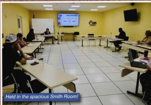
Held in the spacious Smith Room!

Raising the Board is designed to build the skills and confidence of would-be and current members of non-profit boards.