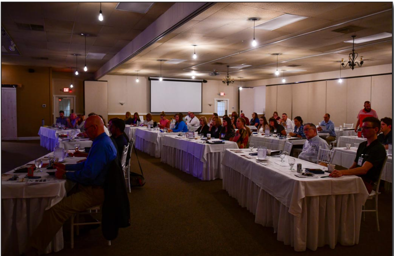
Attendees of Leadercast Live in 2021 look on as one of many world-renowned speakers takes the stage during the simulcast live from Cincinnati.