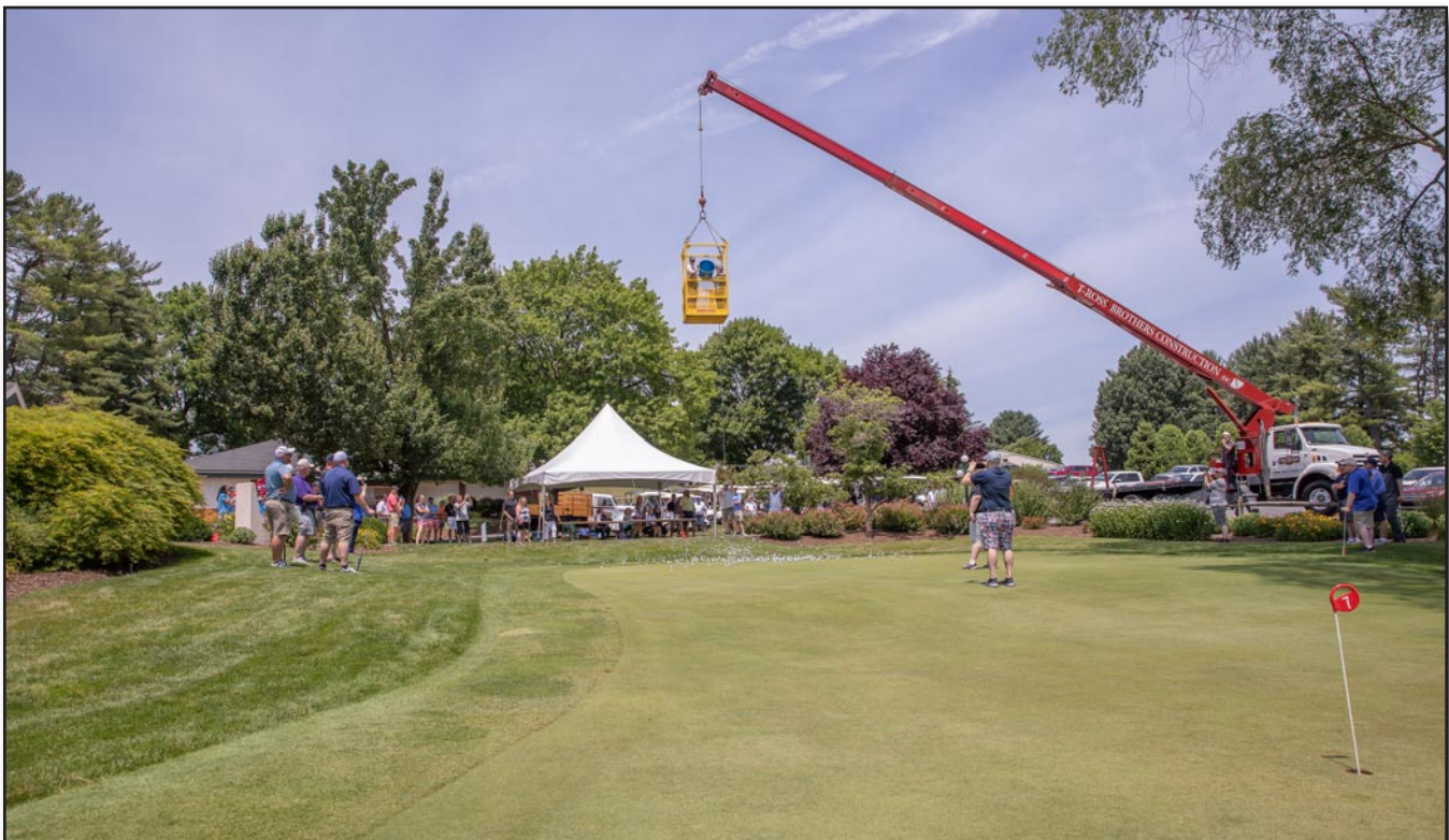
Hundreds of golf balls are dumped onto the practice green at Bucknell Golf Club for the annual Golf Ball Drop!, held prior to the B&E Golf Tournament.

For more information on benefits or sponsorships, call us @ 570-742-7341.