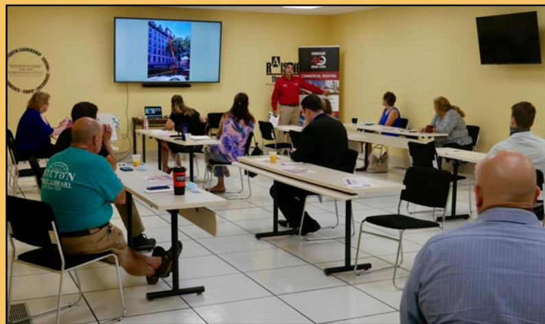
The Central PA Chamber's first Breakfast Briefing since the COVID-19 Pandemic began, held on July 24, was a big hit! To better follow state and federal guidelines, its now being held in the more spacious Smith Room. Guests are also being served breakfast and indicating their level of comfort with personal contact. Event sponsor was XW Construction. Register for upcoming Breakfast Briefings at www.centralpachamber.com/events .