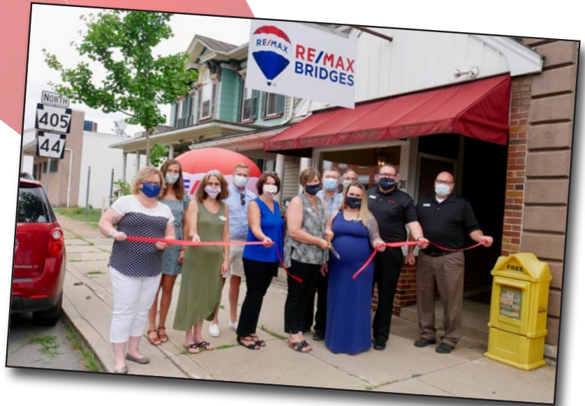
"Momentum" (from page 3)