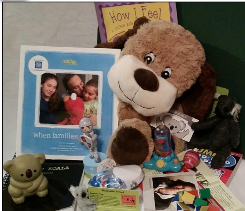
A Comfort Box for a child grieving the loss of a loved one due to COVID-19. These are provided by Camp Koala.