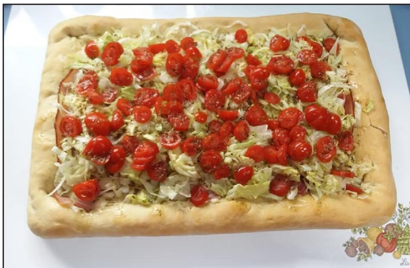
One of the many creations appearing on the private Facebook group 'Pandemic Dinners'. Join today for great meal ideas!

The Central Susquehanna Community Foundation (CSCF) is a 501(c)(3) organization that develops, manages and distributes funds for charitable purposes in communities across the Central Susquehanna region.