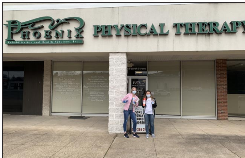
The team at Phoenix Rehab. & Health in Sunbury is ready to help you with your aches and pains, whether it is at their place, yours or a combination of the two using tele-health services.

"Sorting through all the news takes time. Evaluating research can be tricky. It is important that business owners like myself take the necessary amount of time to constantly evaluate, test and measure, weaving new recommendations into existing systems so that patients and staff will all be able to return to a safe environment."