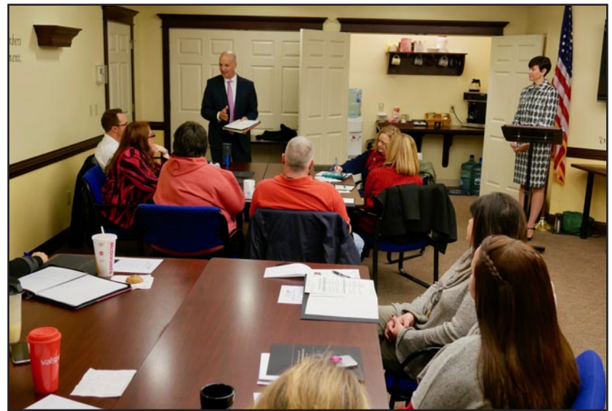
Representatives from McNerney, Page, Vanderlin & Hall address changes to overtime rules to a room full of employers, HR representatives and managers during an informational session in mid-December at the Chamber.

In addition, Gov. Tom Wolf's administration plans to implement rules in the coming years, including raising the threshold to $40,560/annually in 2021 and $45,550 in 2022, with automatic adjustments happening every three years, starting in 2023.