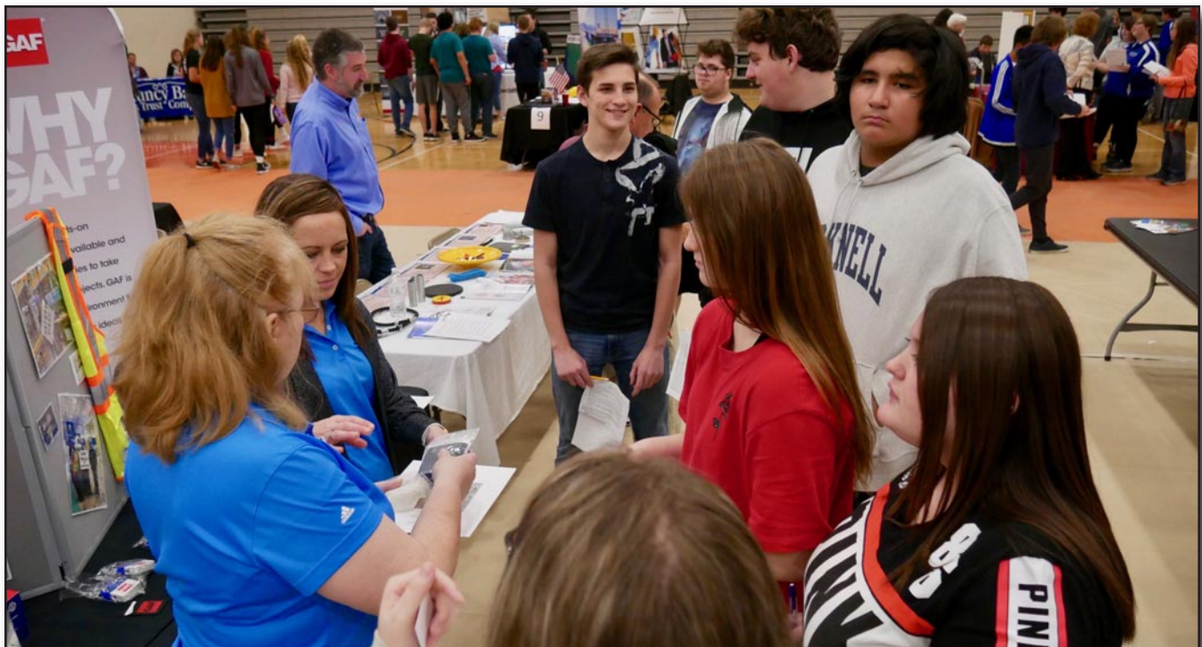
Representatives of GAF Roofing speaking with students about careers at a recent Central PA Career Fair.

For more information on benefits or sponsorships, call us @ 570-742-7341.