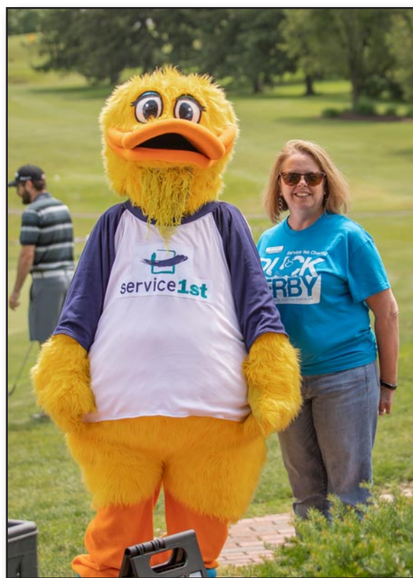
Service 1st Federal Credit Union was the Golf Ball Drop! Sponsor in 2019.