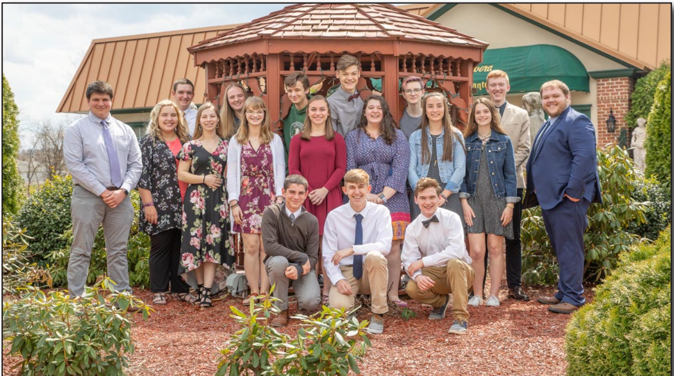
The graduating Class of 2019 District 1.