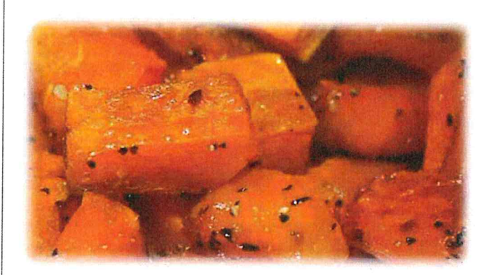
www.allrecipes.com © 2017 Allrecipes.com All Rights Reserved

Per serving : 177 Calories; 7 g Total Fat; 1 g Sat Fat; 0 mg Cholesterol; 30.3 g Carbohydrates; 2.6 g Protein; 5.1 g Fiber; 11 mg Sodium; 905 mg Potassium